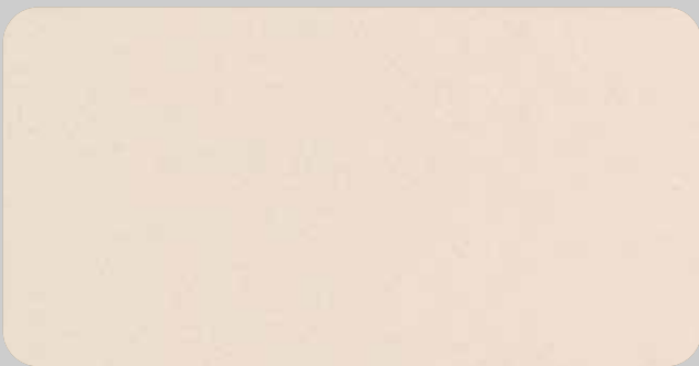
GFRC Sahara Crème