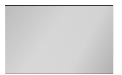
Anodized Look C0 Silver