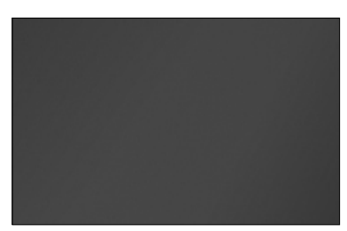
Anodized Look C35 Black