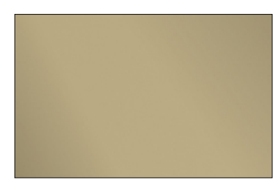
Anodized Look C2 Gold