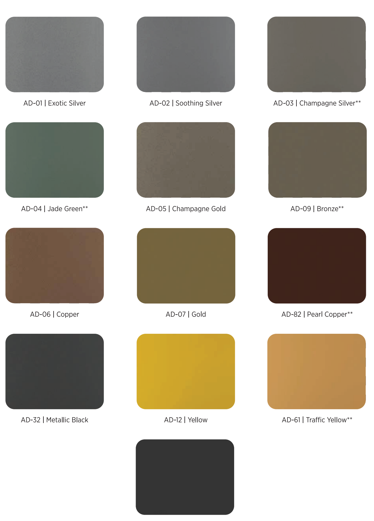
AD-11 | Fashion Grey**