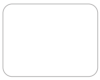
SP-401 | Exterior Mirror