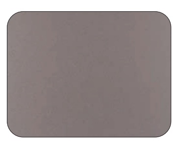
AD-84 | Rose Metallic