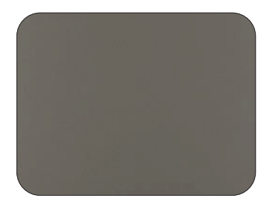
AD-03 | Champagne Silver**