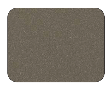
AD-05 | Champagne Gold