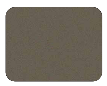
AD-09 | Bronze