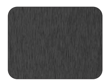
PE-05(N) | Titanium Brushed