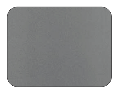
AD-01 | Exotic Silver