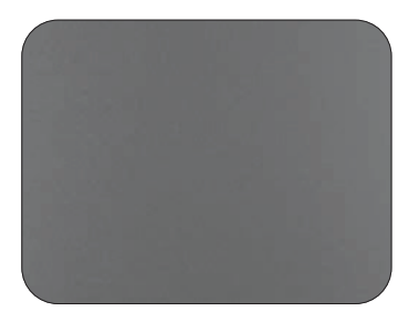
AD-02 | Soothing Silver