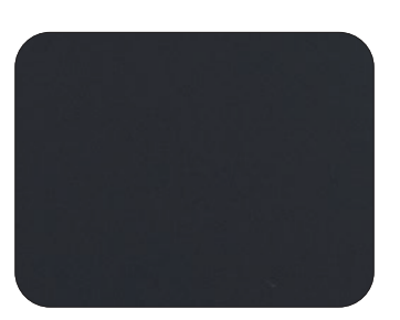
AD-7002 | Coal Grey