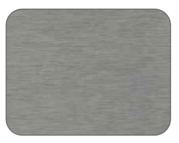
SP-01(E) | Butler Silver