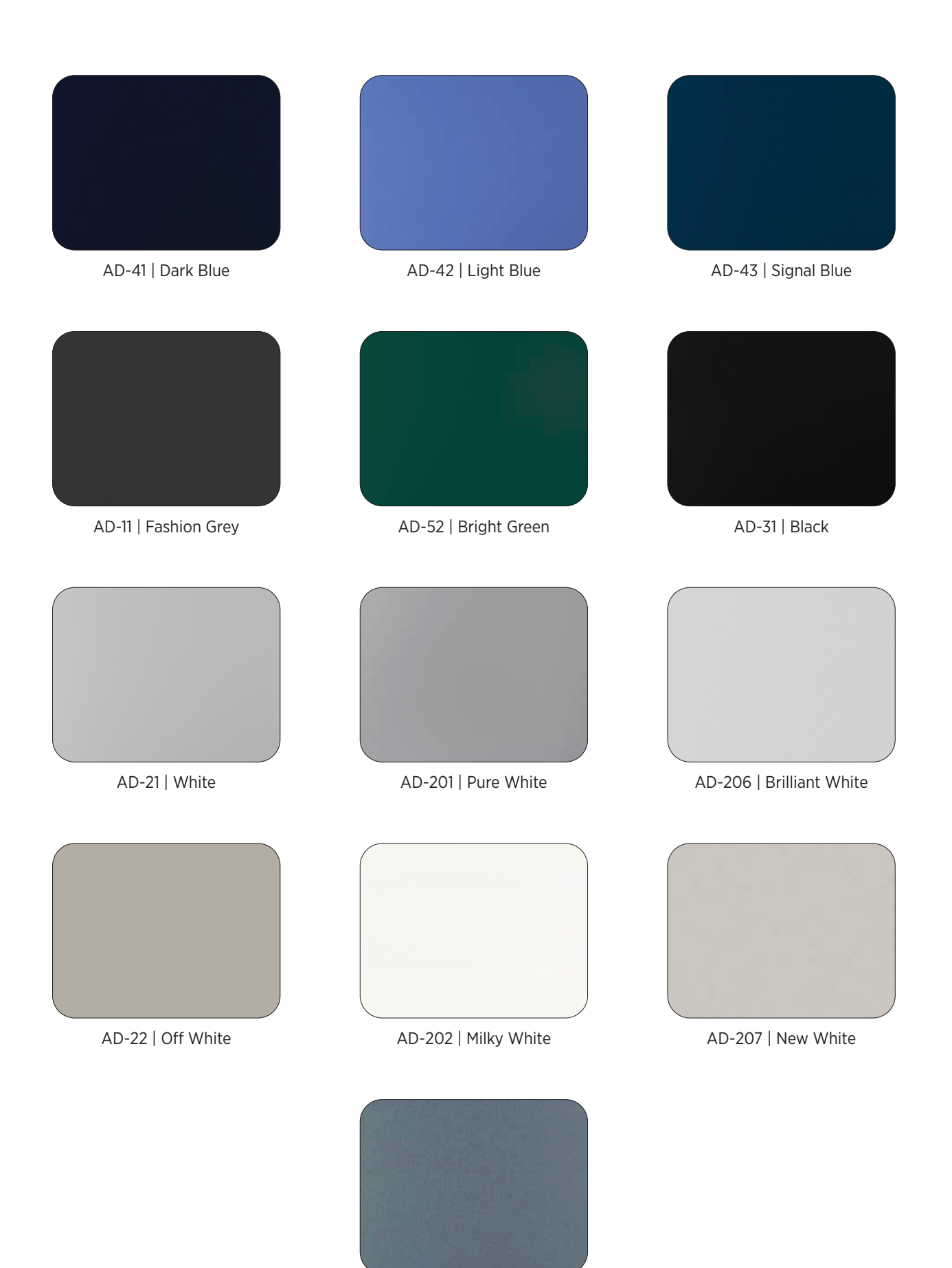
AD-08 | Metallic Blue