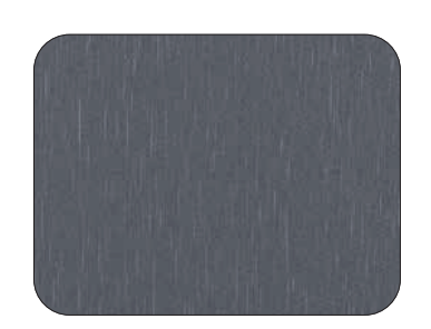
PE-19 | Graphite Brushed