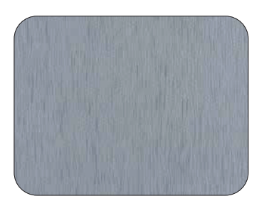
PE-14 | Oxidised Brushed