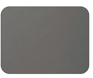
AD-301 | Gun Metallic