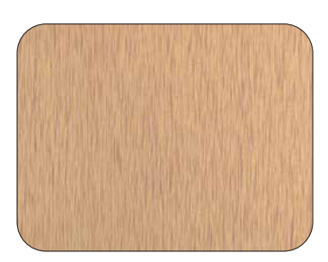
PE-16 | Copper Brushed