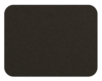
AD-7001 | Dark Bronze