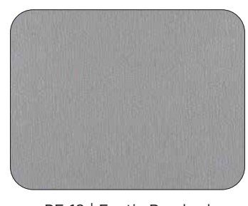
PE-18 | Exotic Brushed